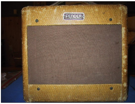
1953 Fender Champ in tweed covering, wide-panel cabinet